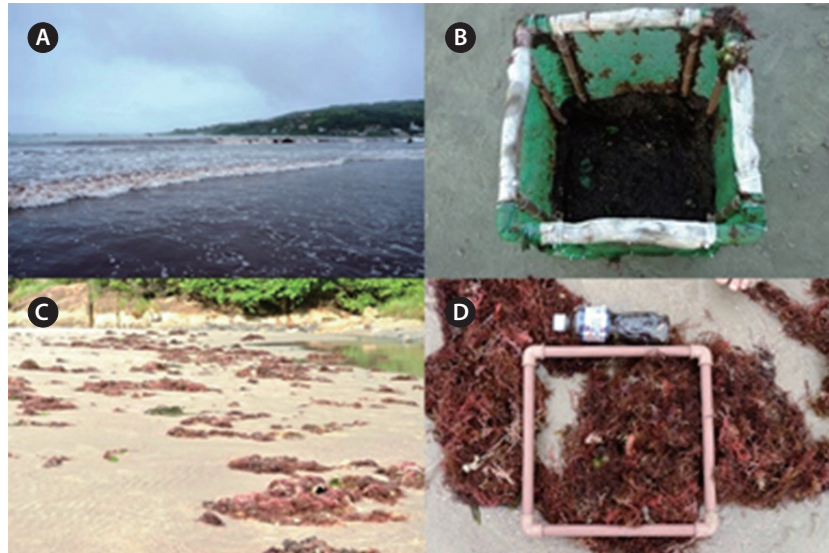
Fig. 2. General aspect of red algal bloom and sampling procedures. (A) Floating algae at Garopaba Center Beach. (B) Cube used for sampling floating material in bloom at Garopaba Center Beach. Note the cube corners made from PVC tubing and the sides were filled with canvas screen with 0.5 mm porosity. (C) Appearance of algal material deposited on the sand of Vigia Beach. (D) PVC Square (30 × 30 cm) utilized to collect samples at the Vigia Beach (wrack and rocky shore zones).

materials collected on the shore and wrack were also frozen at -20^{\circ}\text{C} .